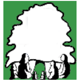
View from Maple room showing where Year 4 and the rest of Year 6 sit